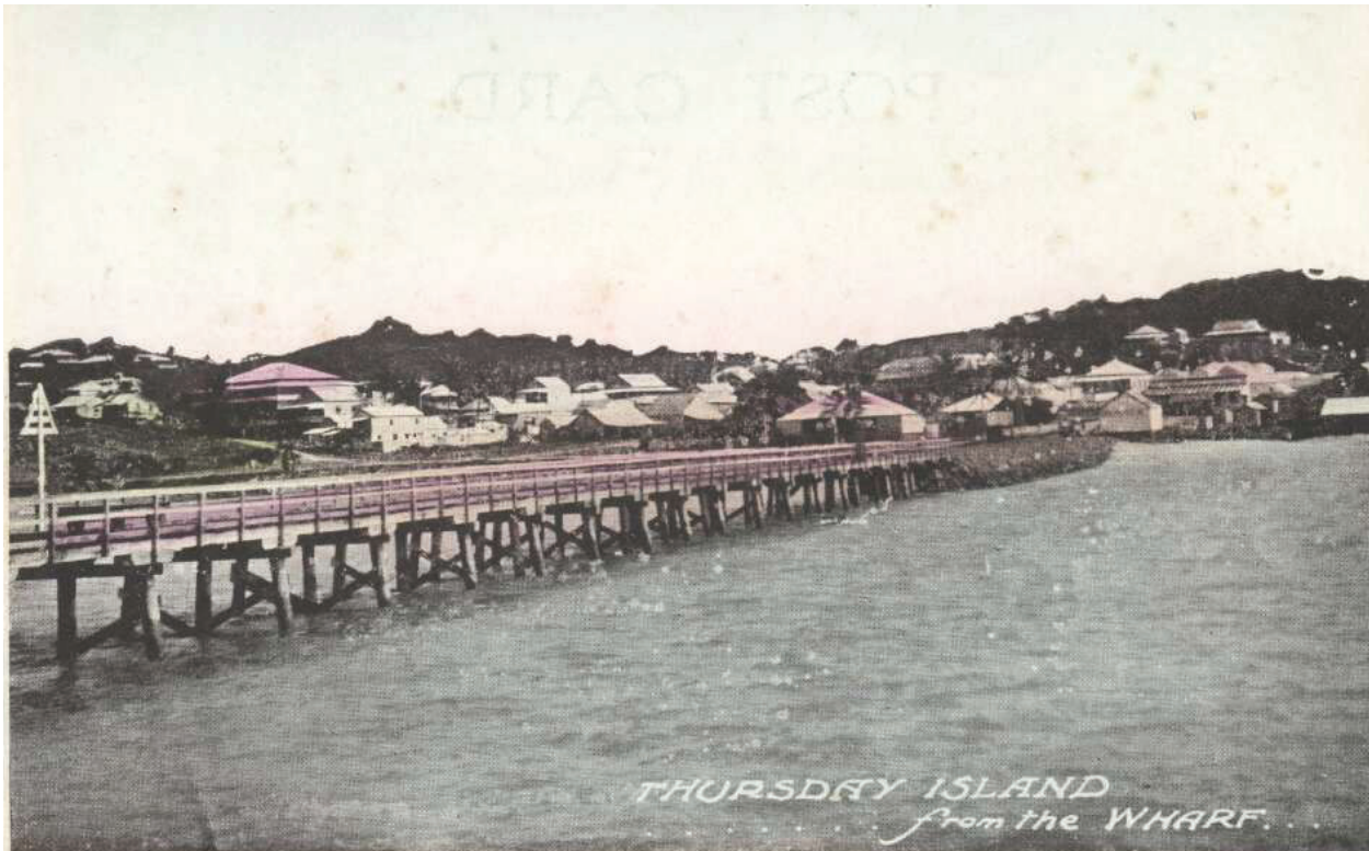
(1917). THURSDAY ISLAND FROM THE WHARF, [CA. 1917-1920]